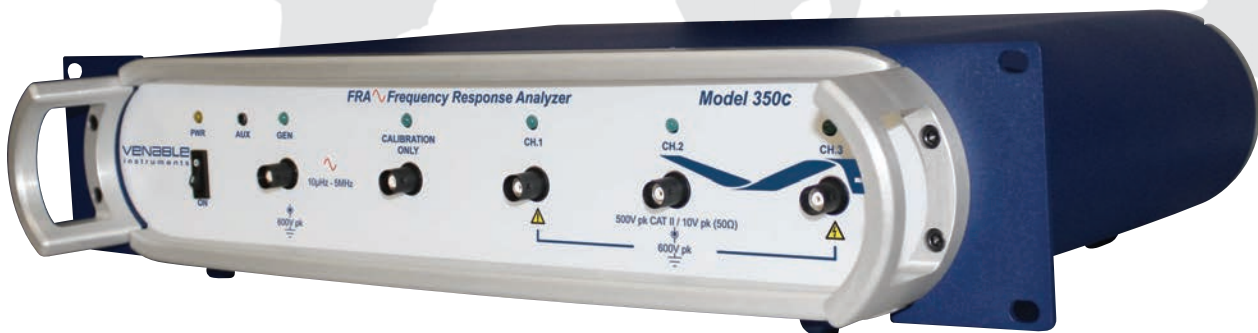
Rack Mount View